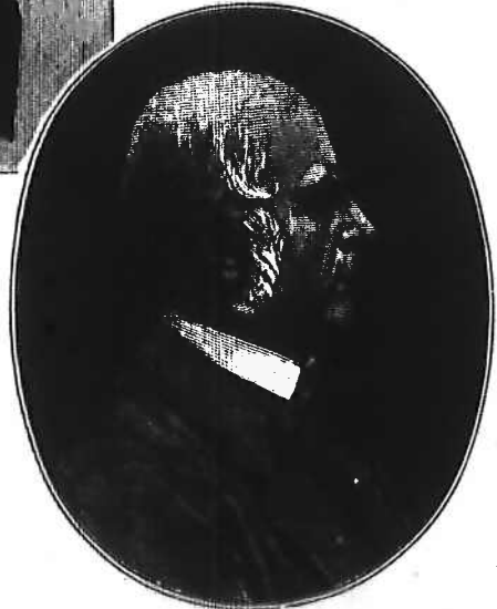
From a) AGE 66. [Photograph]

pometry, and by successful scientific travel. Mr. Galton was born in 1822, and after studying medicine, graduated at Trinity College,