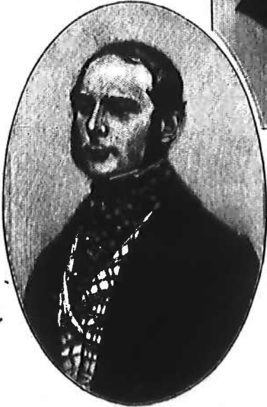
From a) AGE 22. [Photograph]

Society. His "Meteorographica," in 1863, resulted in establishing the theory and existence of anti-cyclones. In 1886 a gold medal came to him from the Royal Society. He has been President of the Anthropological Institute and Vice-President of the Royal and Royal Geographical Societies, and is now chairman of the committee in