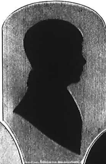
AGE 12. From a Silhouette.

SCIENCE possesses a learned devotee in Mr. Francis Galton—a name made famous by research in the subjects of heredity, meteorology, anthro-